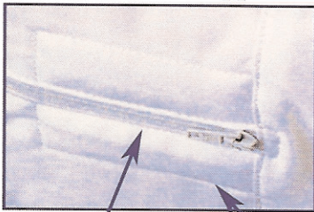
Micro-zipper teeth Stitched safety trap